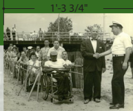
In 1954, Federation members mount a successful campaign to build a cement walkway under the Conny Island boardwalk so that people in wheelchairs can access the beach—part of a commitment to help all people fully participate in society.