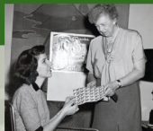
In December 1952, Eleanor Roosevelt visited the Federation and purchased the agency's first holiday fundraising stall.