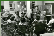
The Federation and NYC agency partners develop a job training program for homebound adolescents—one of the first in the U.S. for youth with physical and emotional disabilities.